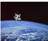
Space Station Mir

Also continuing in the Library's federal depository is a bulletin board display on "Living in Space." It features historic and current information on Mir, the International Space Station, and other affiliated space research.