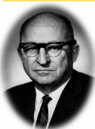
Edwin A. Link

"Everything that can be invented has been invented." - Charles H. Duell, Commissioner, U.S. Office of Patents, 1899