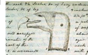
Sketch of a “California Condor” from the Lewis & Clark journals