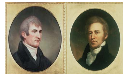
Portrait of Meriwether Lewis by Charles Willson Peale, ca. 1807

September is the last month to enjoy the Library's " Rediscovering Lewis and Clark " information resources display and its accompanying original four-minute multimedia presentation. Located in the first-floor lobby, this display includes books, government information, Internet sites, and journal excerpts related to the so-called "Corps of Discovery" appointed by President Thomas Jefferson in the early 1800s. Led by Meriwether Lewis and William Clark, this 1803-1806 expedition was a turning point in American history, resulting in the identification of natural resources and inhabitants – plant, animals, and human - of the newly explored western territory.