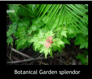
Botanical Garden splendor

The first-floor Students' Artist Guild exhibit will continue through the end of December.