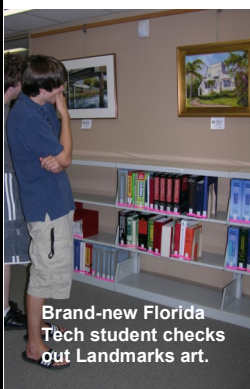
Brand-new Florida Tech student checks out Landmarks art.